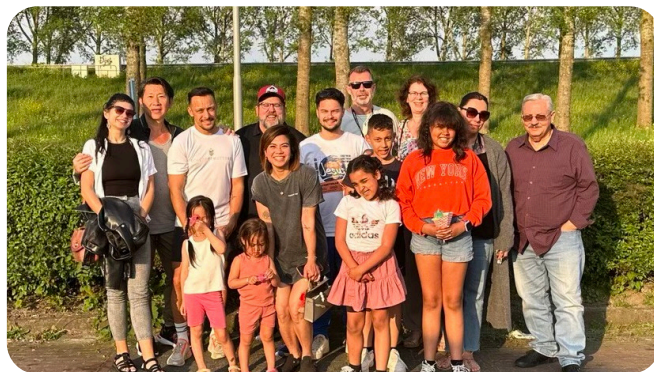
Ministry team and family in Holland