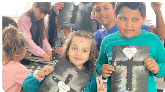
Jesus Christ is ALIVE!