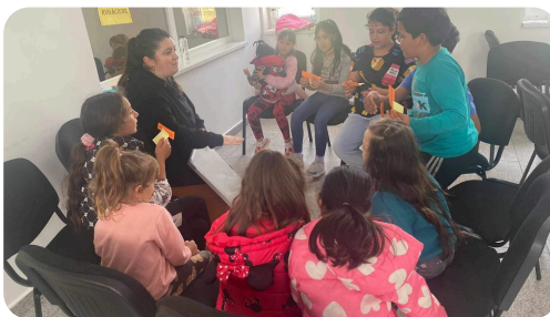
Teaching kids to pray in Romania