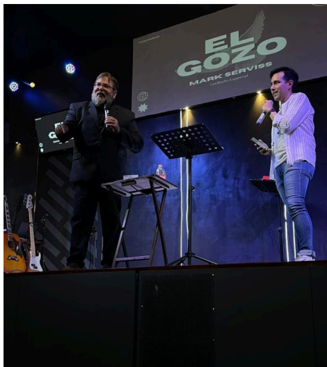
Victory Life Church, Mexico City