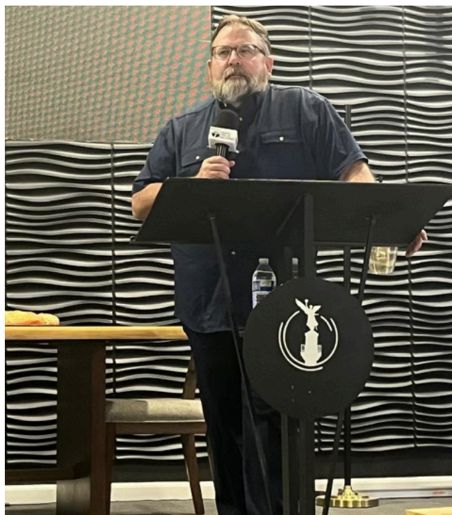
Teaching at CFNI/ Mexico