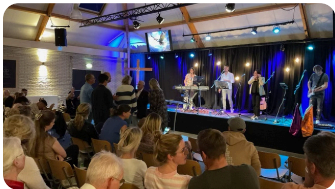
New Life Church, Drachten, Holland