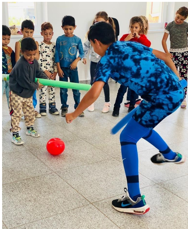
Having a ball