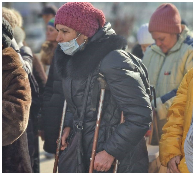
Ready to receive a blessing