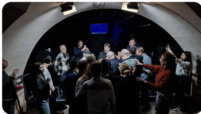
Preaching in basement church