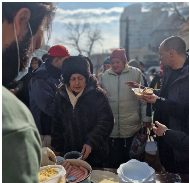
Food for everyone