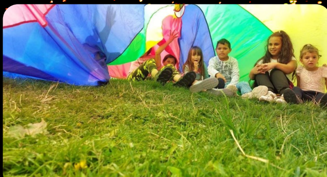
Hiding in the shade