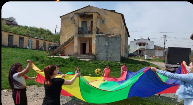
Children's Day Games