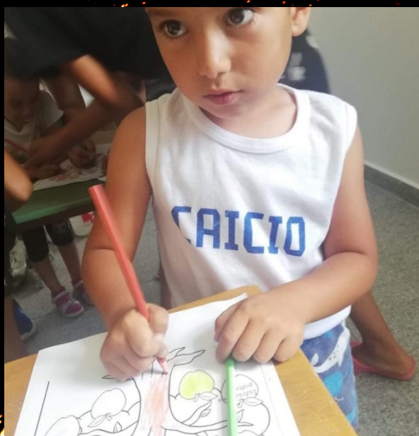
The Fruit of the Spirit