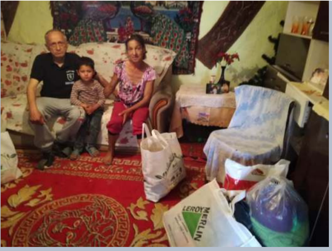
Gypsy family receives food, medicine, blankets and other items.