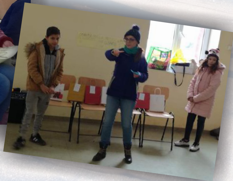
Top L: Boys help tell the story of Creation. Top R: Getting new shoes Right: Picking a reward. Bottom L: Listening to the lesson. Bottom R: 6 Days of Creation game.