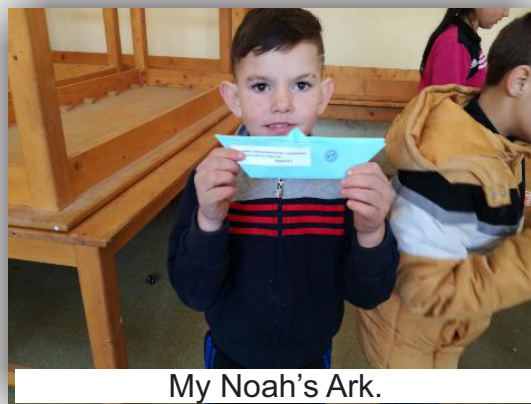
My Noah's Ark.