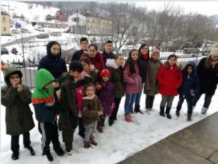
Some of the kids in the Christmas snow!